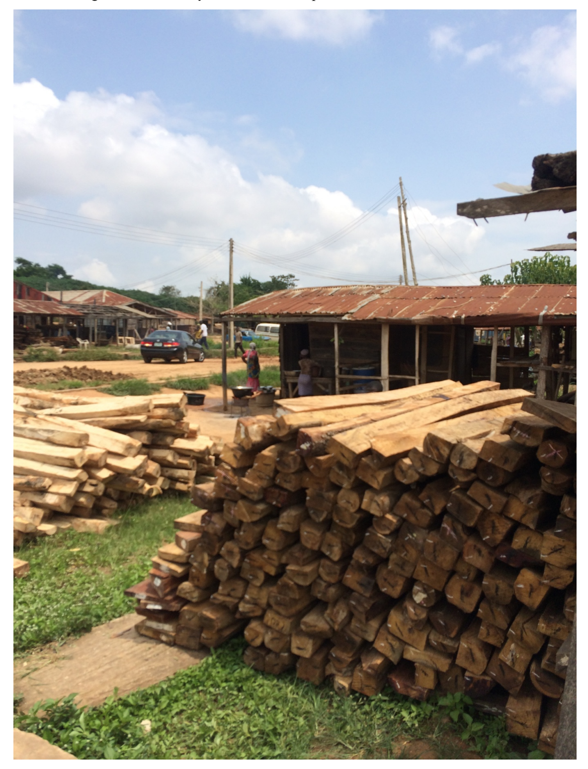
Logs of wood already transformed into planks in one of the sawmills